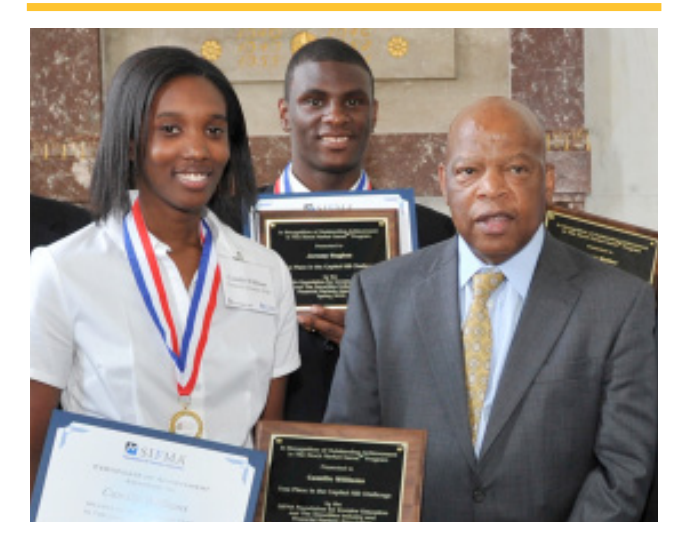
Challenge has drastically altered my perspective on the economy, financial literacy, and even on what I can achieve as I move forward in my life.